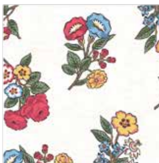
7935-L** 6 1/4 yds (includes backing)