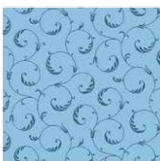
7936-B* 7/8 yd