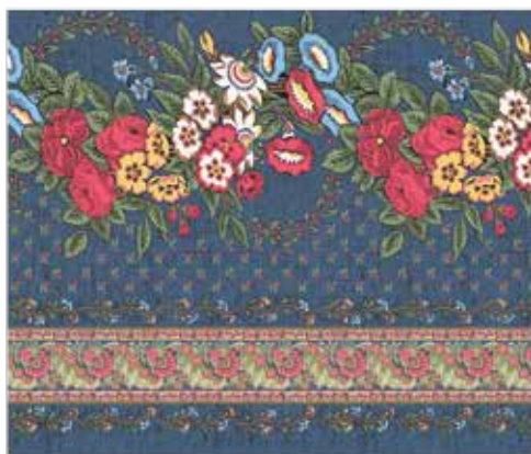
7934-B** 2 1/2 yds