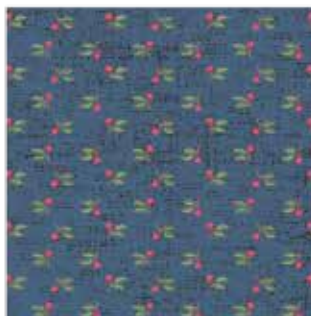
7937-B* 2 yds (includes binding)